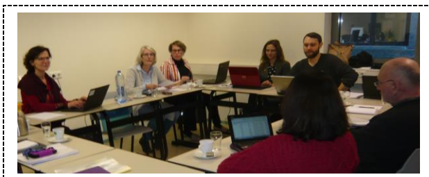
-Image from the January Joint ENOTHE & COTEC Board Meeting in Amsterdam